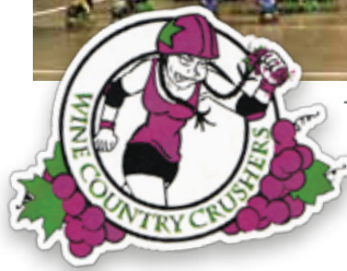
The Wine Country Crushers following a match last Summer held in the SunDome.