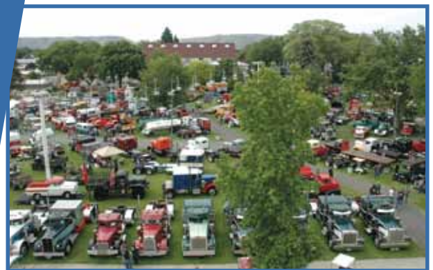
2013 National American Truck Historical Show at State Fair Park

With over 900 historical trucks on display and 3,600 visitors in attendance, area hotels and restaurants welcomed this national event. According to Yakima Valley Tourism, this event generated an estimated $3 million in economic impact. A special thanks to local chapter member Don Stone for advocating to hold the convention in the Yakima Valley and to Yakima Valley Tourism for their assistance.